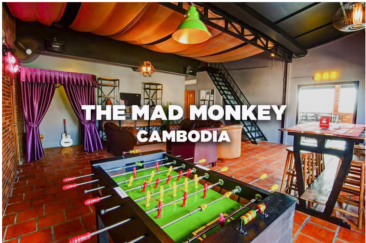
The Mad Monkey, Phnom Pehn, Cambodia - Winner of the Special Contribution Award