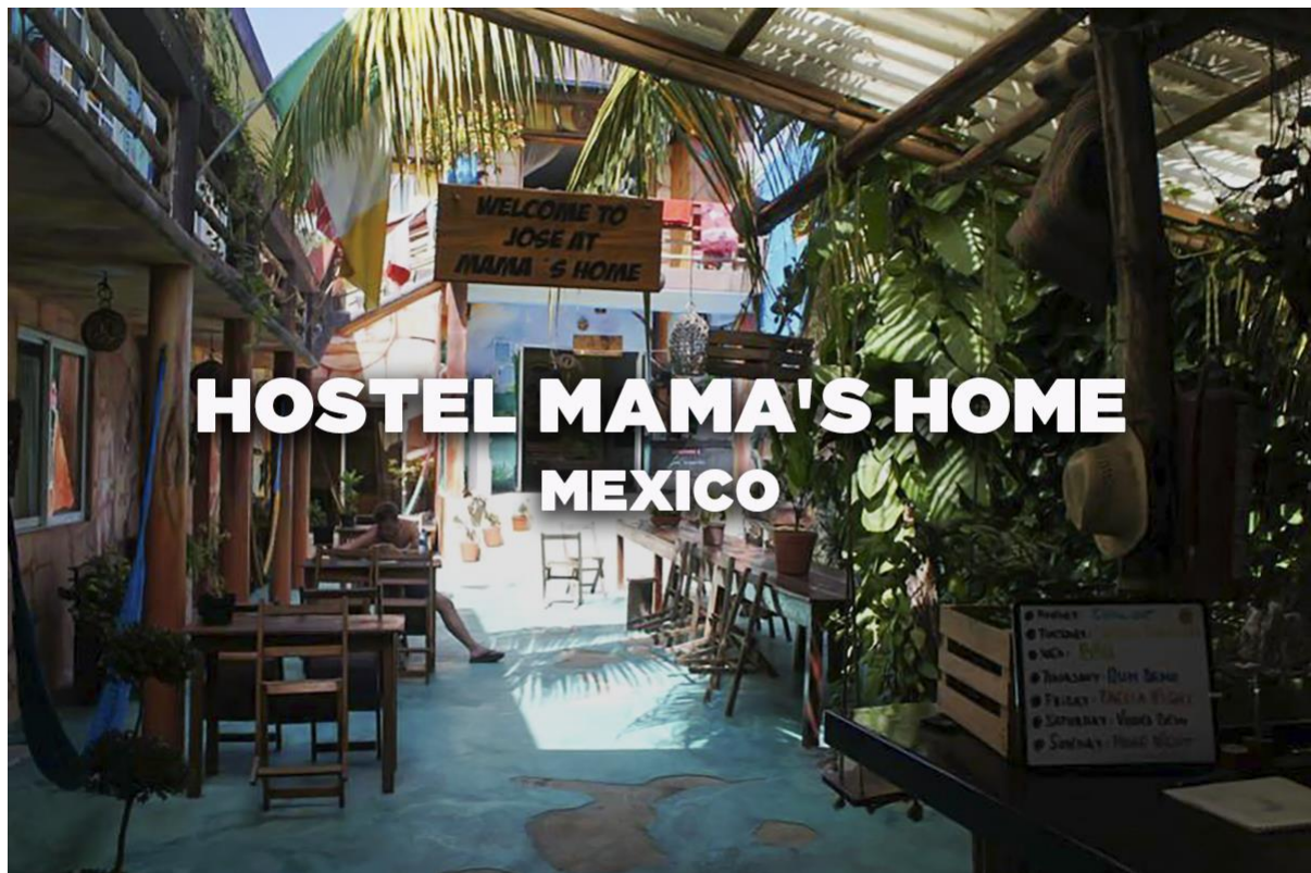
Mama's Home, Tulum, Mexico - Winner of Best Hostel in Northern America