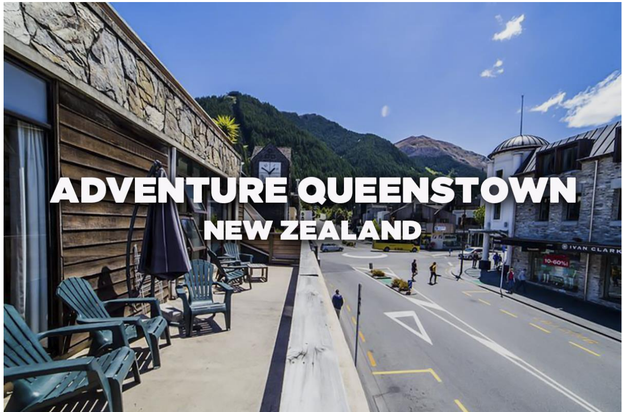
Adventure Queenstown, Queenstown, Australia - Winner of Best Hostel in Oceania