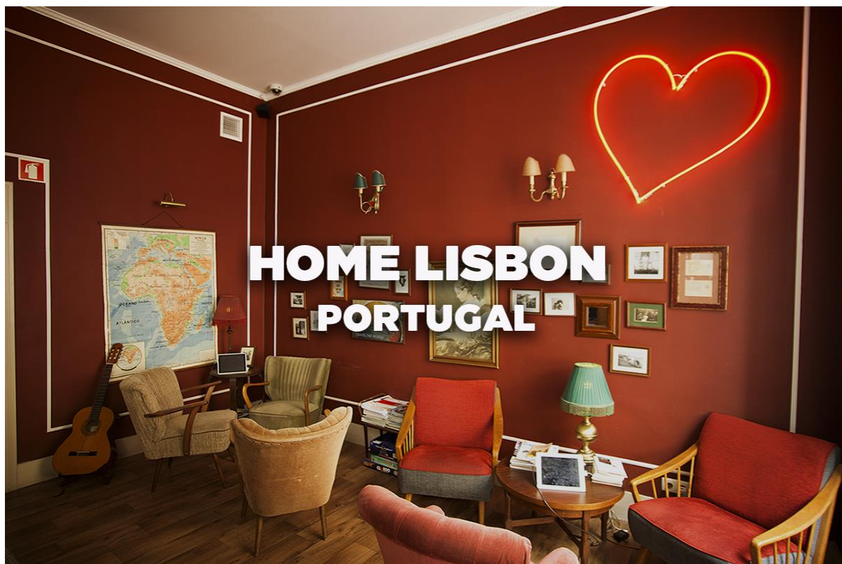
Home Lisbon, Lisbon, Portugal – Winner of Best Medium Hostel Worldwide