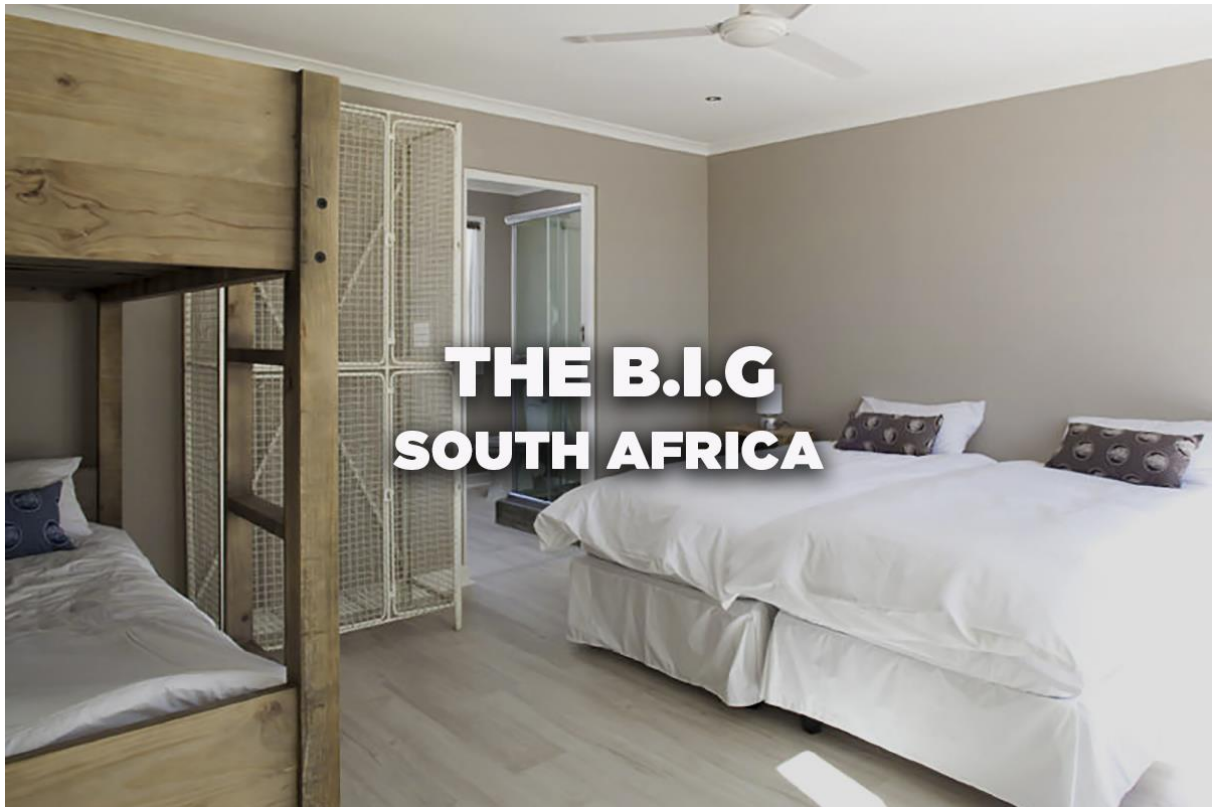
The B.I.G, Cape Town, South Africa - Winner of Best Hostel in Africa