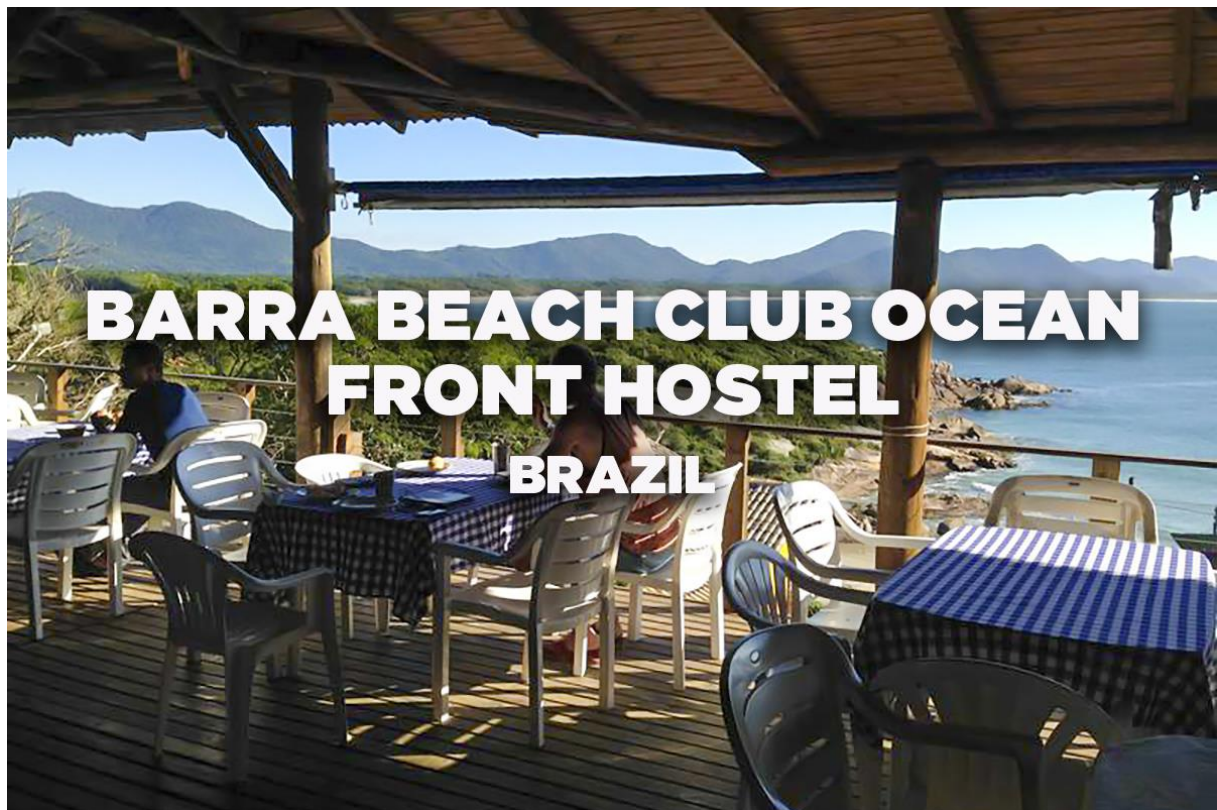
Barra Beach Club Oceanfront Hostel, Florianopolis, Brazil - Winner of Best Hostel in Latin America