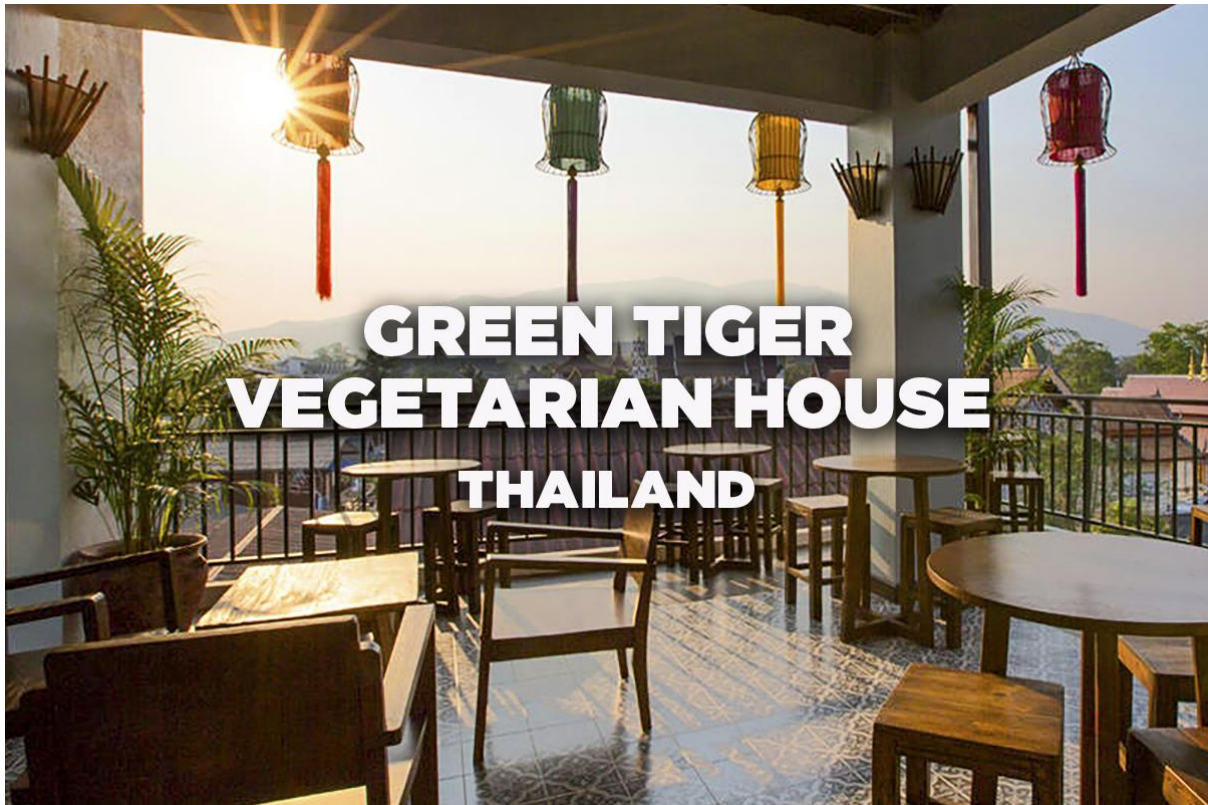
Green Tiger Vegetarian House, Chiang Mai, Thailand - Winner of Best Hostel in Asia