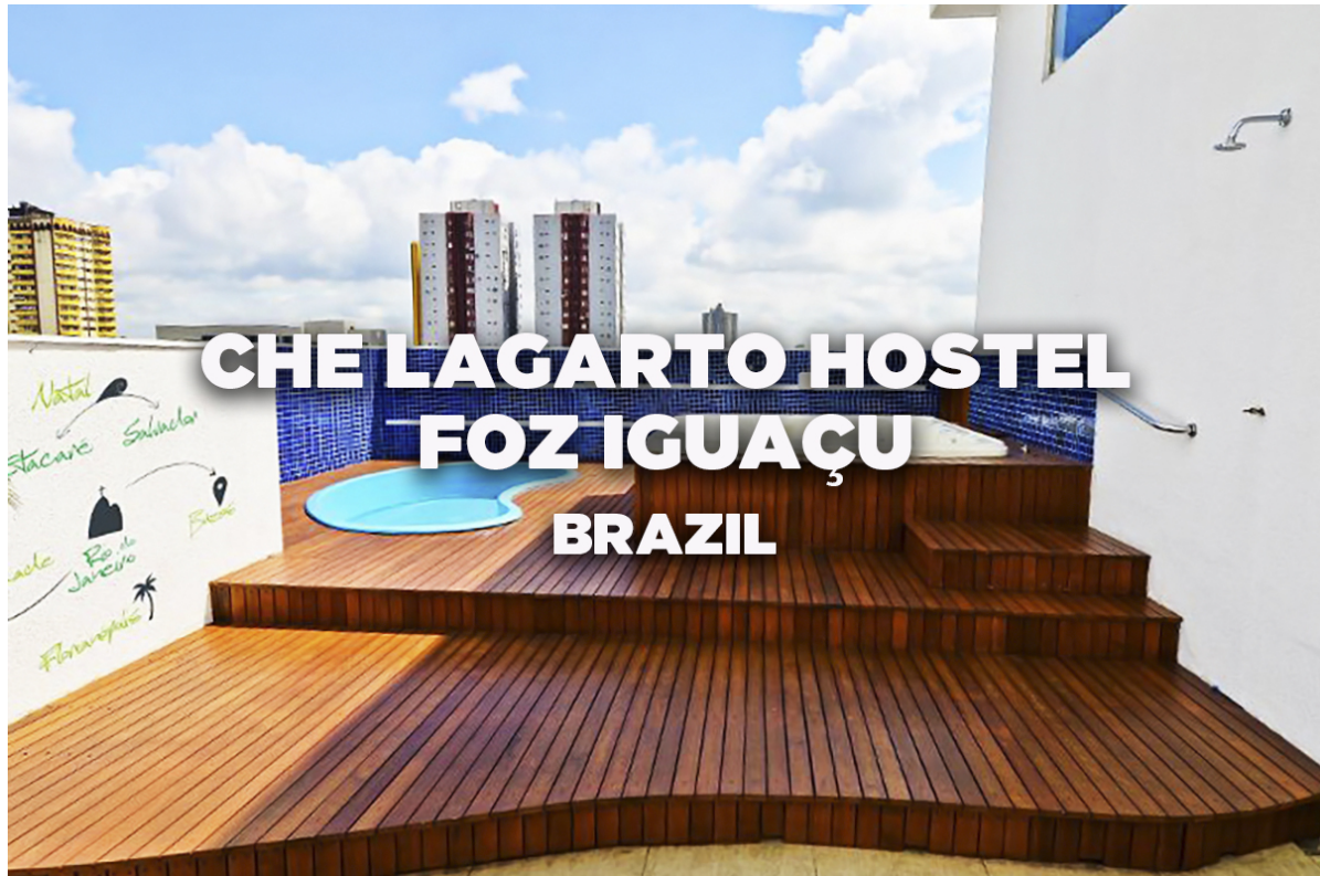
Che Lagarto Hostel Foz do Iguaçu, Foz do Iguaçu, Brazil - Winner of Best Large Hostel

The 'Best Large Hostel' category has undergone a complete reshuffle with four new entrants. Meander Taipei, which offers its own daily cycling tour, came in at second; Tattva Design Hostel in Porto, which boasts a beautiful rooftop terrace, placed third and Space Inn Taipei that emulates a space pod thanks to its futuristic design came in sixth.