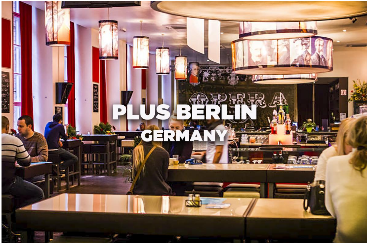
PLUS Berlin, Berlin, Germany – Winner of Best Extra Large Hostel Worldwide

Taking the top spot for Best Extra Large Hostel once again was PLUS Berlin which wows with a swimming pool, sauna and garden where customers can sip on a cold beer whilst enjoying a warm summers evening in Germany's capital city.