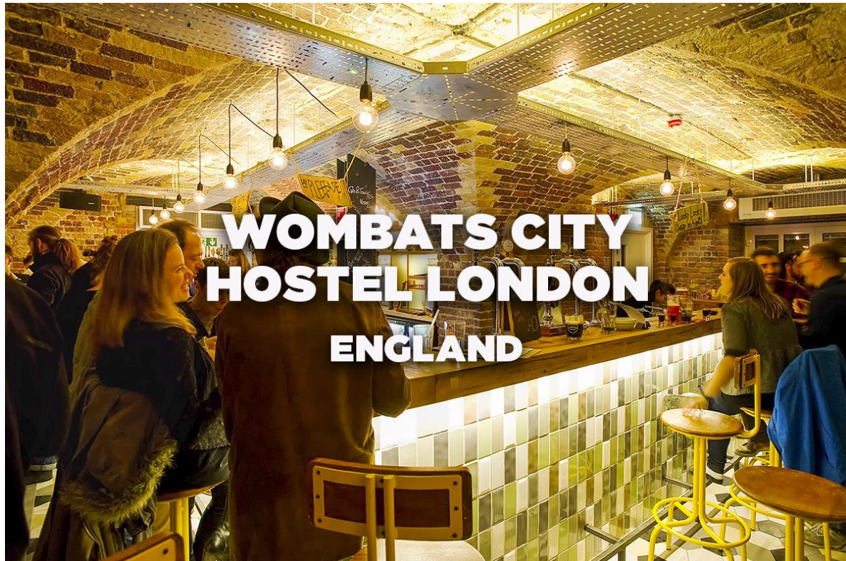
Wombats, London, England – Winner of Most Popular Hostel in London

Wombats City Hostel London, which opened in 2014, has made a massive impression on travellers to London and collected HOSCARS for both Most Popular Hostel in London and Best Hostel in England. Wombats is known for its modern design, lively atmosphere and unique social areas.